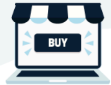
Trent Moscord Spare Parts E-Marketplace