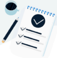
Port Equipment Services & Solutions