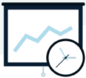
Port Development & Services