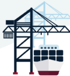
Port Equipment Procurement